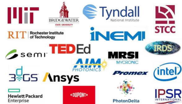
Figure 2. Current FUTUR-IC Partners

supply chain; Workforce: SEMI sustainability literacy for executives and incumbent workers.